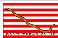
Le US Navy jack, drapeau de guerre de l'US NAVY