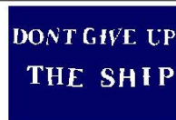
Le drapeau du commodore Perry à la bataille du lac Erié